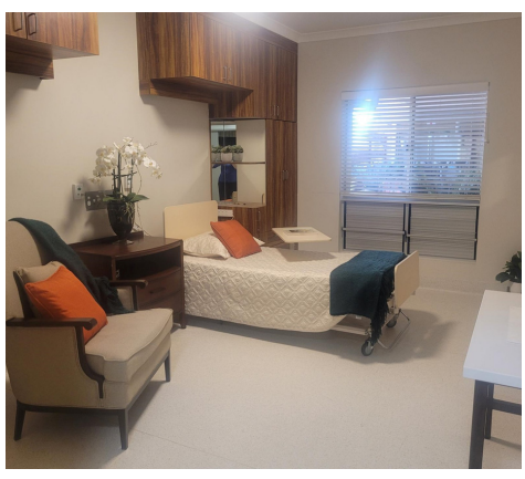
Premium Suite RAD Price: $474 000*