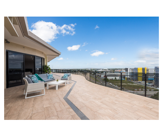
*Prices may change without notice