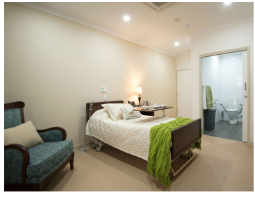
Vista Suite RAD Price: $685 000*