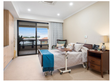
Premium Suite RAD Price: $895 000*