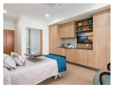
Vista Special Care Suite RAD Price: $685 000*