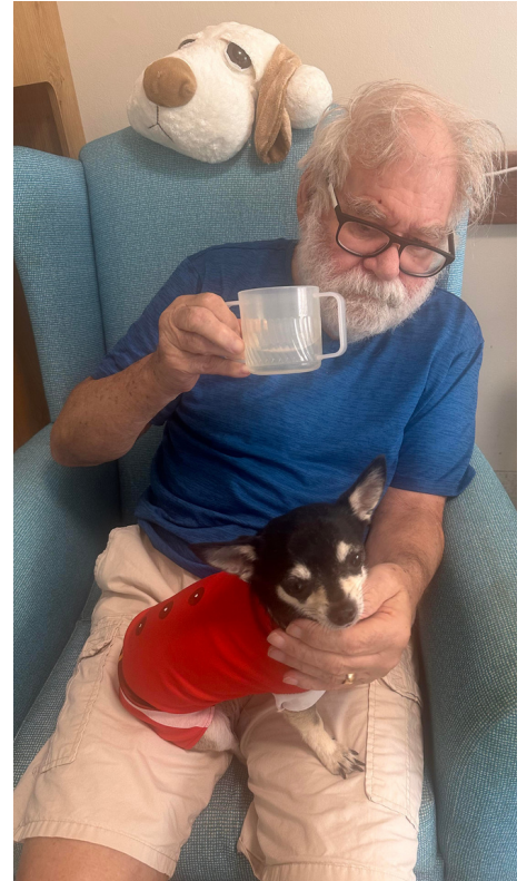
Pet Visit, a letter from a student at Birkdale South State School and Easter Craft.