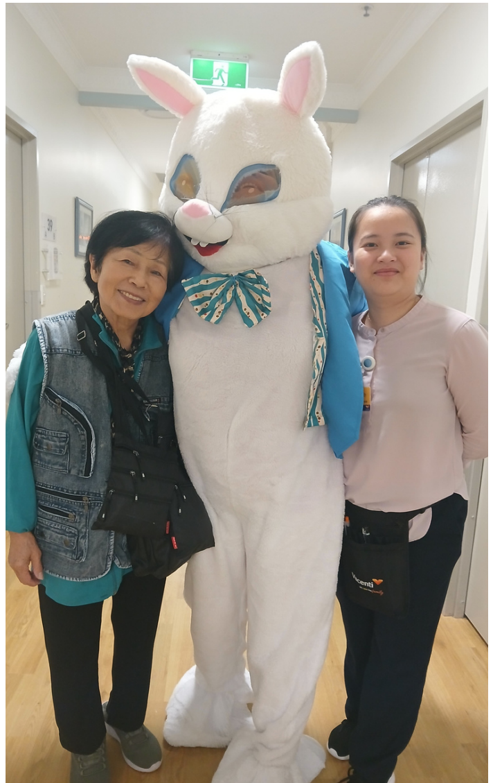
Easter Bunny Visit